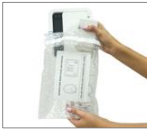
Place Devices In Bubble Bag With Matching Picture