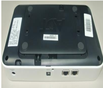
Remove Cables. Place Base Unit Face Down