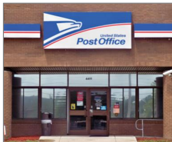
United States Postal Service