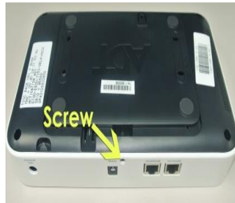
Remove Retaining Screw