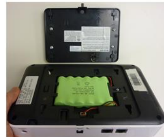
Press Upwards To Slide Base Unit Off Mounting Plate