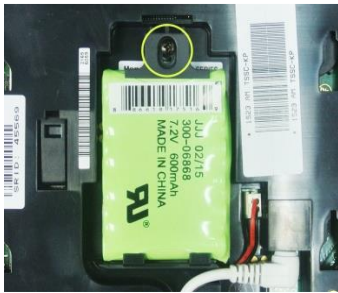
Loosen The Screw That Holds The Battery In Place