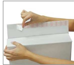
Peel Adhesive Liner