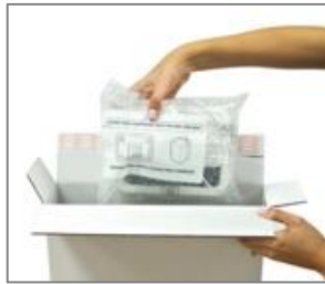
Place Devices In Box