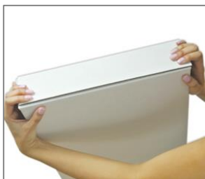
Fold The Flap Down