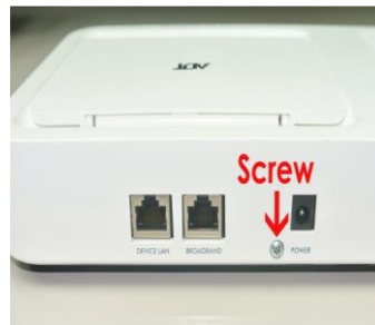
Remove Retaining Screw