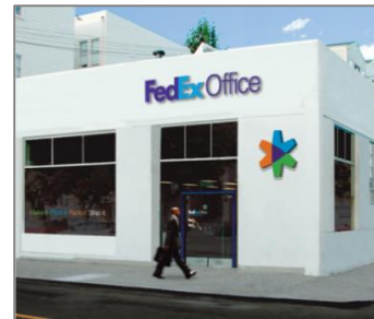
FedEx Office FedEx World Service Center® Or FedEx Authorized ShipCenter®