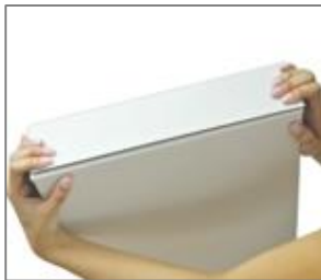
Peel Adhesive Label And Fold Flap To Seal Box