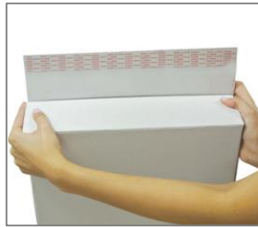
Fold The Flap Down