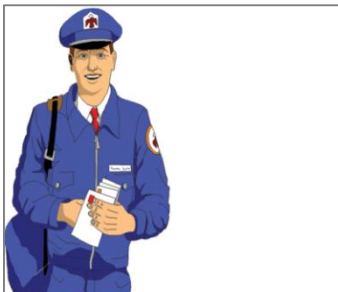
Give To Your Mail Carrier