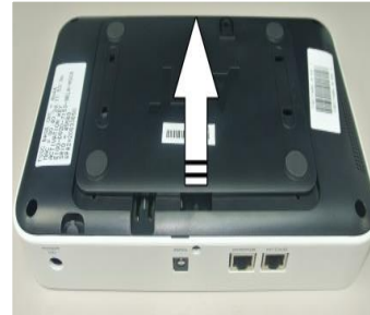
Push Cover Downward To Remove