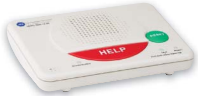
(Figure A) BASE UNIT