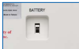
(Figure F) ON/OFF SWITCH