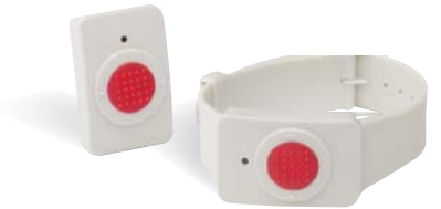
(Figure B) PERSONAL HELP BUTTON